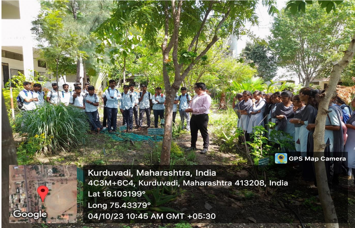
Study of local flora on 04/10/2023